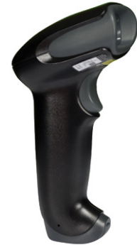
Fig. 1: Voyager 1250g Scanner

Voyager 1250g provides superior scan performance and extended depth of field, which combine to deliver an ergonomic solution for scan-intensive applications.